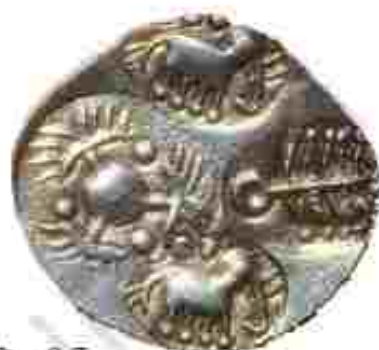
Fig. 2.7 A punch-marked coin, so named because symbols were punched or stamped onto the metal surface

Numismatics is the study of coins, including visual elements such as scripts and images, metallurgical analysis and the contexts in which they have been found.