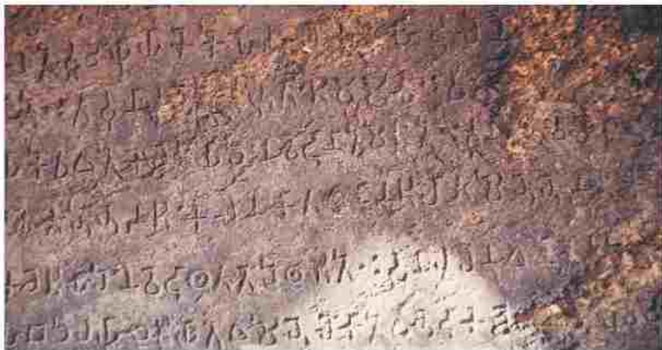
Fig. 2.10 An Asokan inscription