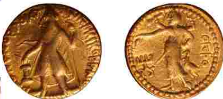
Fig. 2.4 A Kushana coin Obverse: King Kanishka Reverse: A deity

Histories of the Gupta rulers have been reconstructed from literature, coins and inscriptions, including prashastis , composed in praise of kings in particular, and patrons in general, by poets. While historians often attempt to draw factual information from such compositions, those who composed and read them often treasured them as works of poetry.