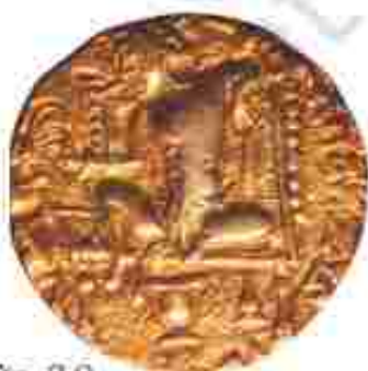
Fig. 2.9 A Gupta coin