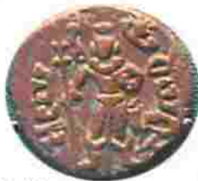
Fig. 2.8 A Yaudheya coin