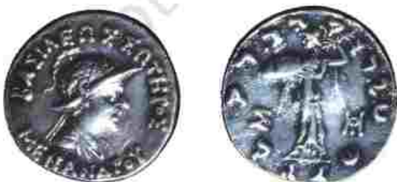
Fig. 2.12 A coin of the Indo-Greek king Menander

➤ Epigraphists have translated the term pativedaka as reporter. In what ways would the functions of the pativedaka have been different from those we generally associate with reporters today?