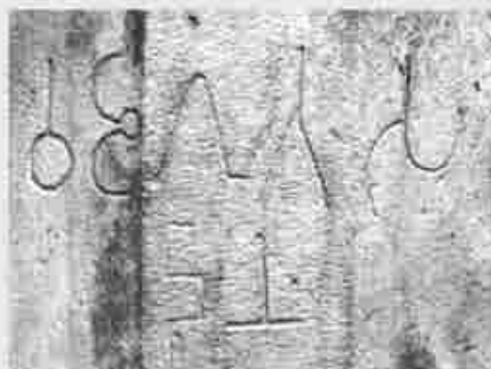
Fig. 2.1 An inscription, Sanchi (Madhya Pradesh), c. second century BCE

There were several developments in different parts of the subcontinent during the long span of 1,500 years following the end of the Harappan civilisation. This was also the period during which the Rigveda was composed by people living along the Indus and its tributaries. Agricultural